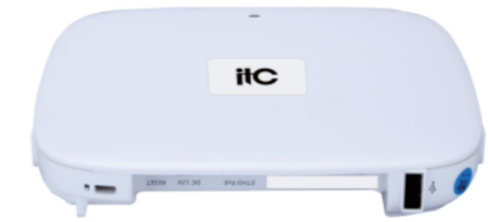
TS-W111 AP Transmitter