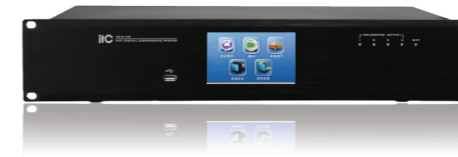
TS-W100 Full Digital WIFI Conference System Controller