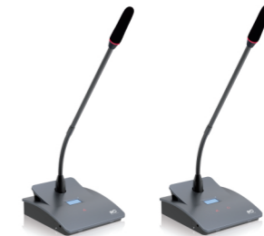
Wireless Chairman Unit TS-W102 Wireless Delegate Unit TS-W102A