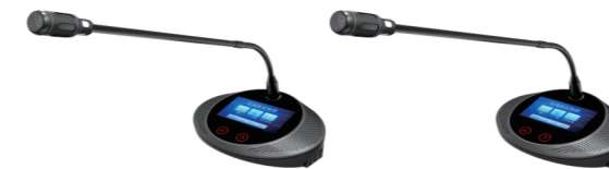
Chairman Unit TS-W101 Delegate Unit TS-W101A